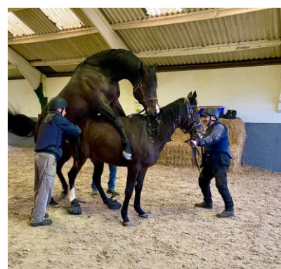
Sergei Covering a Mare

Showcasing continues to operate as one of the top-speed stallions in the country, he has an exciting number of 2yo and older horses to hit the track this year.