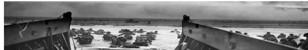
Normandy Landings of Allied Troops onto Omaha Beach